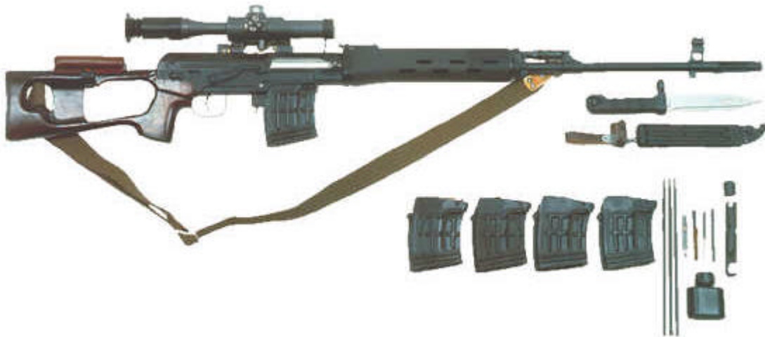
Fig. 1. 7.62-mm Dragunov sniper rifle with optical sight and knife bayonet:

The sniper optical sight is intended for precise aiming of the sniper rifle at various targets.